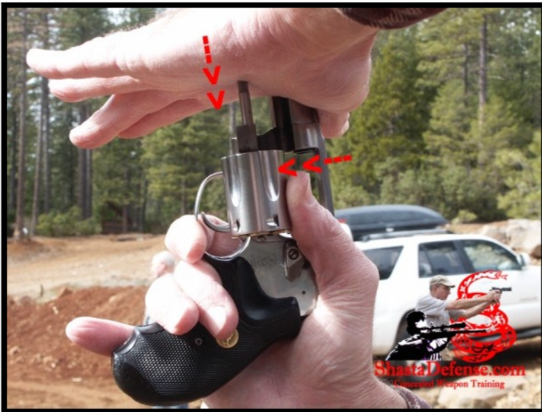
Illustration 7: Revolver is vertical: