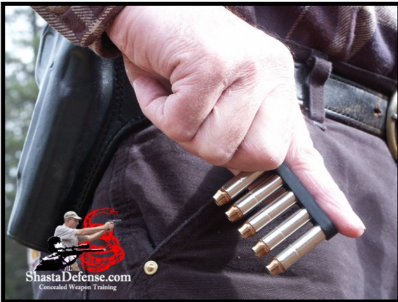
Illustrations 11 and 12: