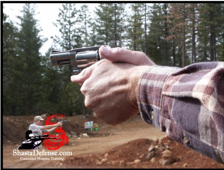
Illustration 19 :

Secure a full firing grip and bring the revolver into a shooting position.