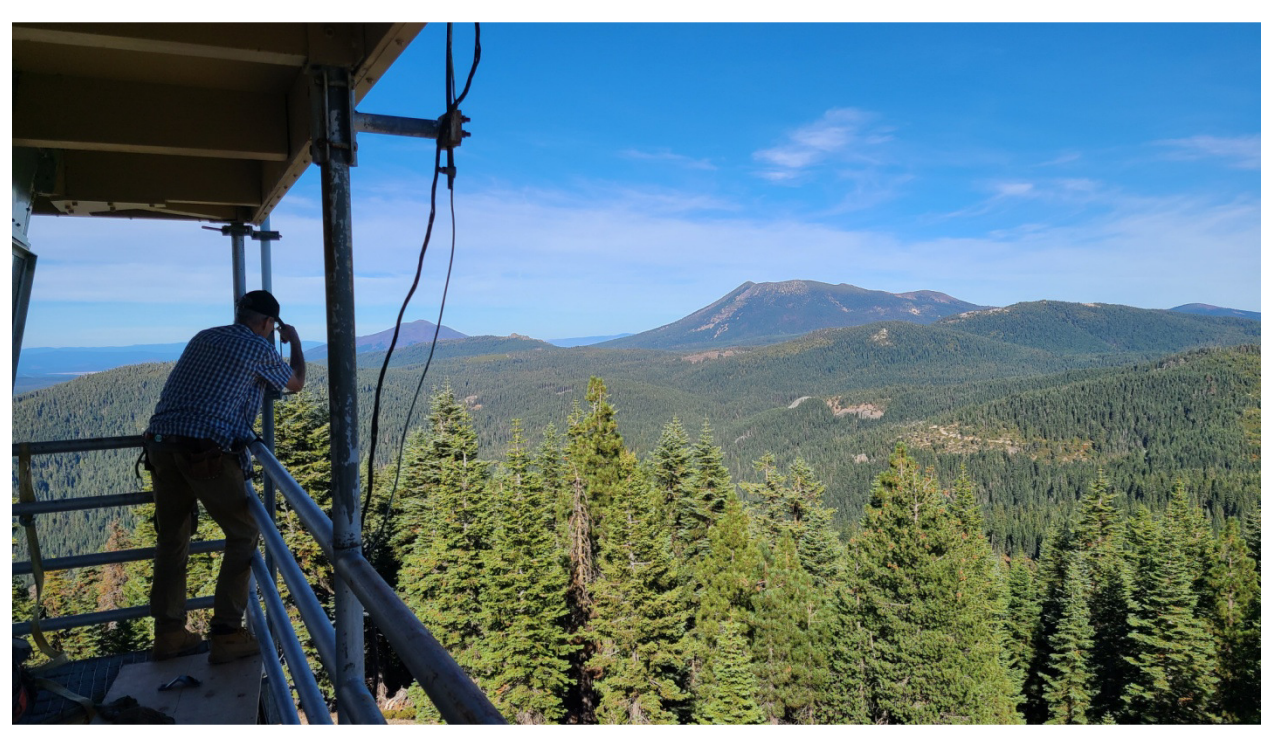
K6PDS AT WORK