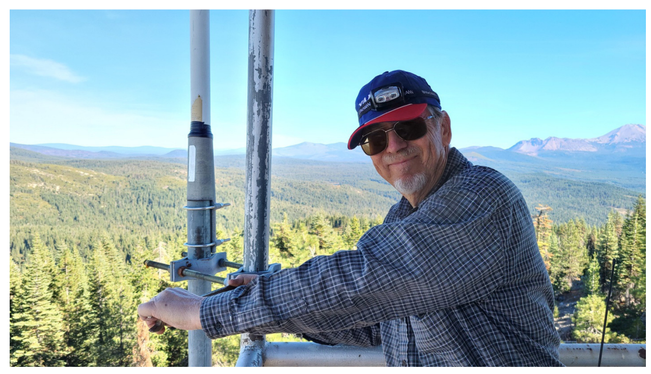
KQ6CS – AT WORK