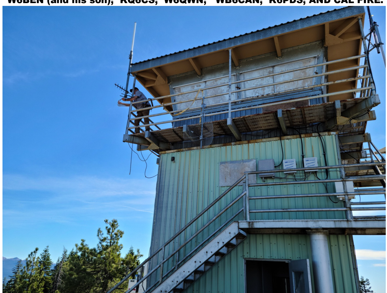
K6PDS WORKING WITH KQ6CS AT THE REPEATER SITE.

W6BEN (and his son); KQ6CS; W6QWN; WB6CAN; K6PDS; AND CAL FIRE.