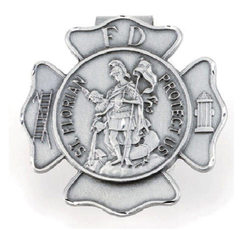
St. Florian, protect Shingletown.